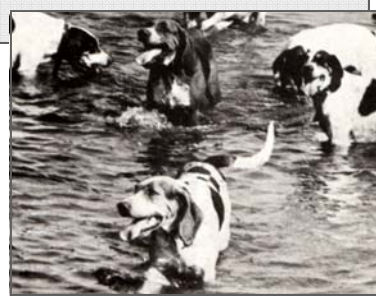
Hounds take a long, cold drink at Woldfeld's Lake—1967