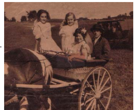
The little girls in the pony cart drew applause at the parade at the Woodhill Country Club in 1933.