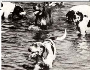
Hounds take a long, cold drink at Woldfeld's Lake—1967