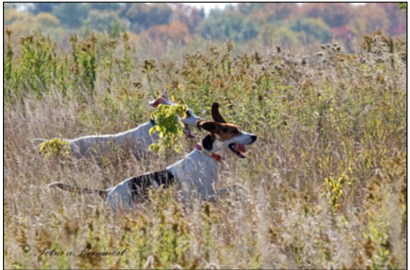
LLH drag hounds 2008 season